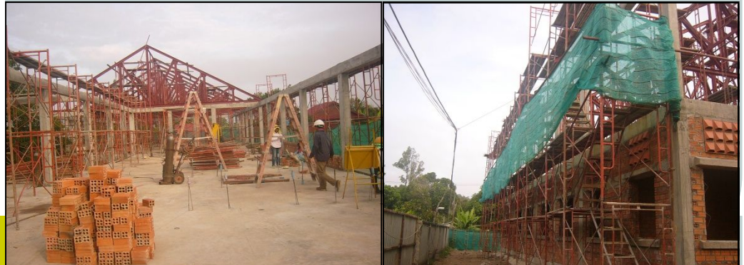
LATEST PHOTOS OF NEW CLINIC.

Mercy Medical Center's building project has moved along. We are in exciting times. Through the donations and pledges over $500,000.00 has already been received. As you can see below the roof is being raised. Another $700,000.00 is needed to complete the $1.2 million campaign. Included in the $1.2 is the Remodelling of the Hallelujah clinic - which is already completed. Building of the main medical center - half way completed. Building of the dormitory to house some of the staff, students and short term teams (housing of the short term teams will bring in some money to help with sustainability). Equipment for the medical center. Endowment (money put aside to help with operating costs). We are so thankful to all the donors that God has allowed to partner with MMC at this time.